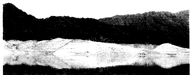
Fig. 1. Bare lakeside lands at Lake Paro, Korea

Although some semi-arid regions have been covered with plants as a result of afforestation policies, many barren lands have recently appeared for reasons such as deforestation and construction work. Lake Paro, which is a large artificial reservoir in Korea containing 900 million tons of oligotrophic water, was almost drained for many years because of a political situation in the Korean peninsula, and a large submerged area was exposed (Fig. 1). Such depleted areas spoil the beauty of the lake landscape; moreover, bare lakeside lands are prone to erosion and collapse. Tree planting is the most efficient means for the vegetation and afforestation of barren land areas. However, revegetation, either natural or artificial, may not be appropriate in certain areas, like the steep