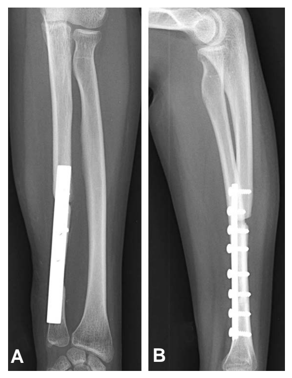
Fig. 4. Postoperative antero-posterior and lateral radiographs is shown.

Because of the huge extraosseous soft tissue mass, wide excision was performed for definitive surgery rather than curettage. Including previous biopsy incision, en bloc excision was done. Distal ulnar osteotomy was done 4 cm proximal from the ulnar styloid process and at the 5 cm proximal from that level, proximal ulnar osteotomy was done. For reconstruction of the ulna, we used left fibular diaphysis as autograft. For reducing donor site morbidity, 5 cm length and half the width of fibula was harvested preserving continuity of fibula. Fibular autograft was fixed to the ulna by 8 hole plate and screws (Fig. 4). Postoperatively, compression dressing and long arm splint