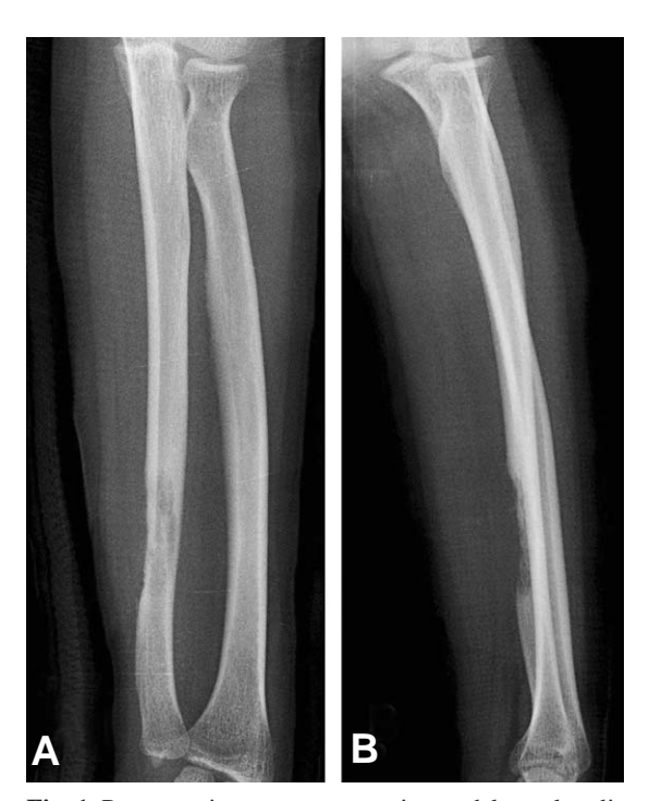
Fig. 1. Preoperative antero-posterior and lateral radiographs is shown.

An 18-year-old, right-hand dominant girl