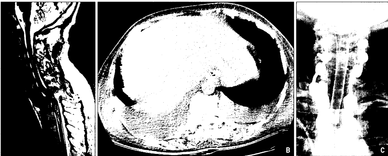
Fig. 2. Case 2. Sagittal T2-weighted magnetic resonance image (A) of the cervical spine shows dislocation of C7 on T1 and spinal cord compression. Chest computed tomography (B) demonstrates severe hemothorax. Postoperative anteroposterior cervical spine radiograph (C) shows posterior instrumentation.

MRI revealed a C6-C7 fracture-dislocation and a C7 burst fracture. He underwent posterior fixation after decompression and open reduction followed by C7 corpectomy and anterior cervical strut reconstruction with sternotomy. Lateral mass polyaxial screws in C4, C5, C6 and pedicle polyaxial screws were placed in T1, T2 and two dual diameter rods were used to connect with polyaxial screw heads at both sides instrumentation. A lateral offset connector was necessary to link the rod with polyaxial screw head in right C7 pedicle. Also, sternotomy was performed because of position of the manubrium. Finally, a mesh cylinder packed with bone chips in C7 corpectomy site was inserted and then an anterior locking plate system was placed. He could ambulate at the time of discharge.