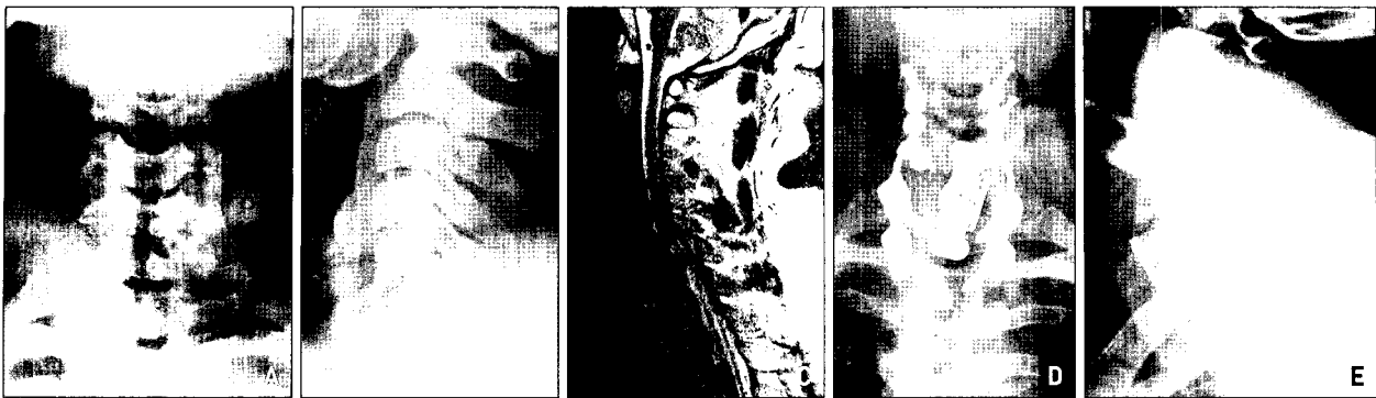
Fig. 1. Case 1. Anteroposterior (A) and lateral (B) cervical spine radiographs fail to demonstrate the cervicothoracic junction. Sagittal T2-weighted magnetic resonance image (C) of the cervical spine shows dislocation of C6 on C7, C7 bursting fracture and spinal cord compression. Quality of MRI is not good due to motion artifact from poor cooperation of the patient. Postoperative radiographs (D, E) demonstrating anterior, posterior instrumentation and wires used for sternotomy.