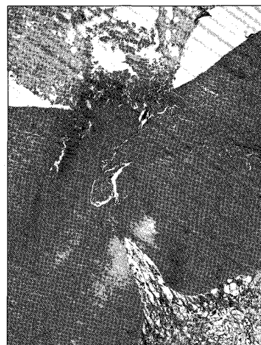
Figure 4. Histological section of mandibular molar of dog after pulp capping with CaSO 4 (Haematoxylin and eosin stain: original magnification \times 200 ).

MTA has been found to induce dentinogenesis when used as a pulp capping agent. However, entire process by which this occurs has not been explained. MTA induced a greater frequency of dentin-bridge formation, less pulp inflammation, and bridges compared with calcium hydroxide 11) . When human osteosarcoma cells 17) , or osteoblasts 18,19) were cultured in the presence of MTA, the cell growth was good. MTA further offered a biologically active substrate for cell attachment, while increased levels of alkaline phosphatase, osteocalcin, and interleukin-6 and -8 were measured. In vitro studies, the antibacterial effects of MTA are comparable to those of calcium hydroxide 8) . Pitt Ford et al. 10) have documented that