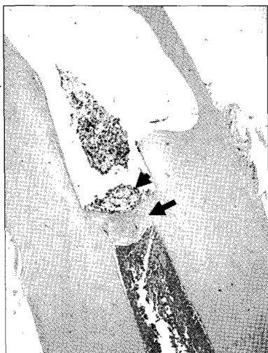
Figure 1. Histological section of maxillary canine of dog after pulp capping with MTA (Haematoxylin and eosin stain: original magnification \times 40 ). Black arrow indicates newly formed hard tissue. Black arrow head indicates MTA particle.

Respectively, 8 teeth were treated in each experimental group. At two months after treatment, the animals were sacrificed by administration of an overdose of anesthetic. The extracted teeth were fixed in 10% neutral-buffered formalin solution and decalcified in formic acid-sodium citrate. They were prepared for histological examination in the usual manner. The sections were stained with haematoxylin and eosin.