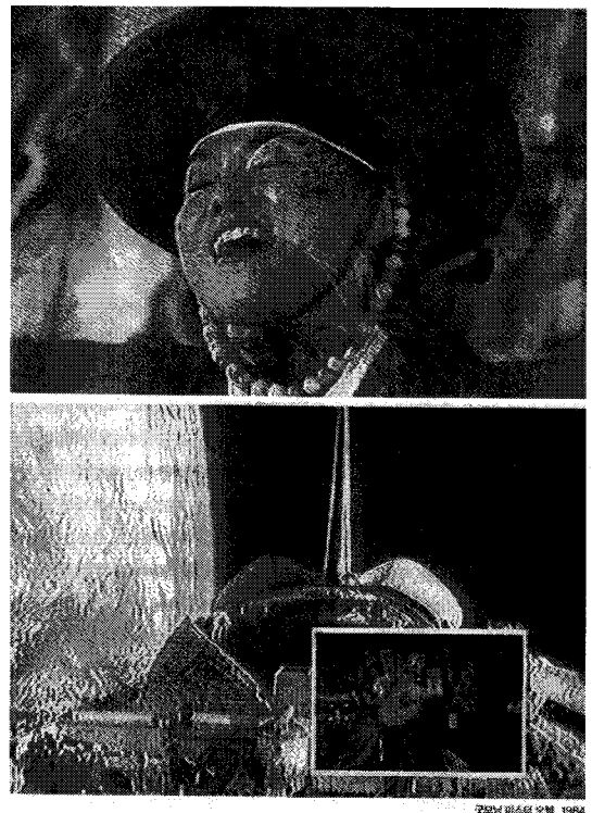
Fig. 2. <Good Morning Mr. Orwell>, 1984.

Paik Nam-June's images which are made by video collage become signs with disorganized meanings, and float among the networks of meanings. In this case, the observer can either find the meaning from image fragments or not. After that, we can experience pluralized perception which demands both a microscopic viewpoint and a macroscopic viewpoint by the arrangement of TVs.