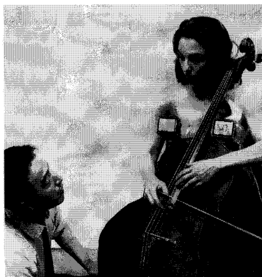
Fig. 1. TV-bra for living sculpture, 1969.

If it is so, how images and noise which are compiled in the video screen of Paik Nam-June can be combined?