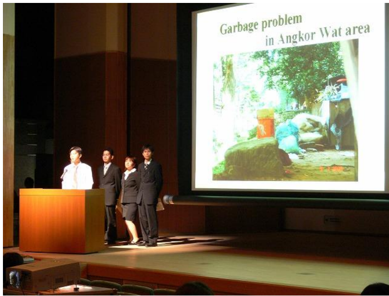
Figure 1. Japan and Cambodia joint presentation at the World Youth Meeting