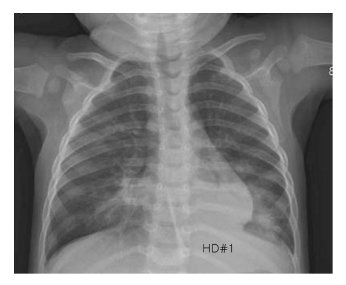
Fig. 1. Bilateral infiltrations in both lower lungs without evidence of cardiomegaly on admission.

radiograph revealed bilateral infiltrations in both lower lungs without evidence of cardiomegaly (Fig. 1). He was moved to the intensive care unit on hospital day 2 due to respiratory distress and a deteriorating general condition. Antibiotics administration and supportive care, including fluid restriction, continued for HUS with pneumonia. On hospital day 5, the patient showed sudden cyanosis, bradycardia of 60/ min and decreased oxygen saturation of 70%. When an endotracheal tube was inserted without trauma, copious amounts of fresh blood were suctioned via the tube. The follow-up chest radiograph showed a diffuse opacification of both lung fields (Fig. 2A), suggesting ARDS following pulmonary hemorrhage, and a ventilator was applied. He had platelet and fresh frozen plasma transfusions due to thrombocytopenia (53,000/mm<sup>3</sup>) with a prolonged aPTT (80.6 sec). He showed improvement in his general status and chest x-ray (Fig. 2B). However, on hospital day 10, respiratory distress developed again. His chest x-ray demonstrated cardiomegaly (Fig. 2C) and echo-