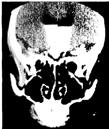
Fig. 4. Computerized tomography cisternography does not indicate the site of cerebrospinal fluid leakage.

planned a surgery for dural defect closure after eradication of meningitis. But, leakage was stopped after improvement of meningitis. On 63th hospital day, she was discharged in neurologically free state. We have checked CT cisternography at out-patient department and the definite CSF leakage site was not detected (Fig. 4).