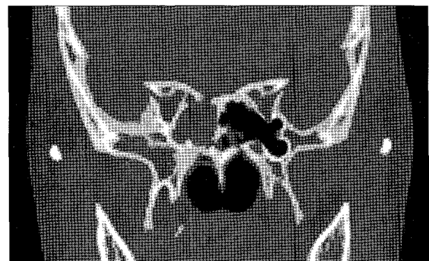
Fig. 2. Ostiomeatal unit computerized tomography revealing defect of sphenoid sinus.