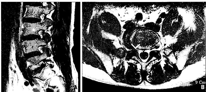
Fig. 1. Magnetic resonance image of a 50-year-old male with right L5 radiculopathy. A : Parasagittal T1-weighted image showing foraminal stenosis with circumferential loss of perineural fat signal at the L5S1 neuroforamen (arrows) compared with intense fat signal at the adjacent levels. B : Axial T1-weighted image revealing diminished sized right L5S1 foramen (arrow head).