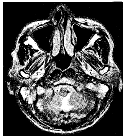
Fig. 1. Preoperative T2-weighted magnetic resonance image showing compression of the medulla by medial deviation of the vertebral artery.