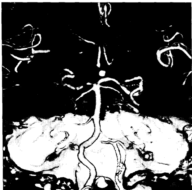
Fig. 2. Computed tomography angiography (PA view) revealing the left vertebral artery that is ectatic and medially deviated.

Improvement in DBN after surgical treatment in patients with structural lesions such as Arnold-Chiari malformation in the cervicomedullary junction has been reported 9,11,17) . Baloh and Spooner suggested that abnormality of eye movement in Arnold-Chiari malformation is due to compression of the herniating cerebellum against the caudal brainstem and is not a congenital aberrancy of the oculomotor pathway 17) . They studied abnormal eye movements in five patients with Arnold-Chiari malformation, and in three patients with DBN the lower brainstem was fo-