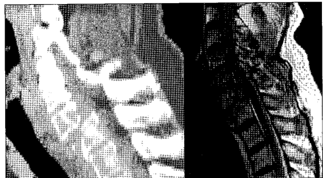
Fig. 3. Computed tomography scan of the cervical spine with sagittal three-dimensional reconstruction and sagittal T2 weighted magnetic resonance image scan. There is a fracture of C7 with an anterior dislocation and a large amount of disc material compressing the cervical cord.

the tingling sensation in both arms persisted, an operation was not performed because of refusal on the part of the patient and patient's guardians. Thus, we decided to apply a rigid neck collar without surgery. The tingling sensation improved with conservative management which included active pain control. The patient was discharged and currently he has been followed for 3 months.