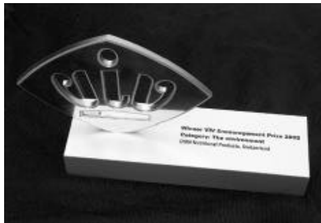
2003 VIV (VIV 2003 encouragement Environment award)

가 VevoVtall Lactic , , + Formic , 가 , ( 2). , Amonia 28 , VevoVtall 가