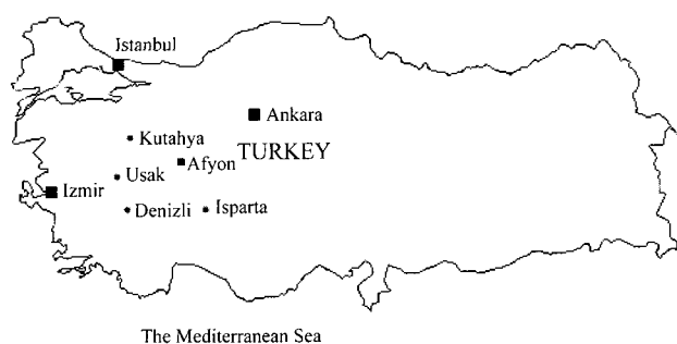
Fig. 1. A map showing the surveyed areas in western Anatolia, Turkey.

study. The houses from which the dust samples were collected were chosen randomly among different districts of each city. The socio-demographic data of families and their housing conditions were questioned by a survey during house-visits. The local humidity and temperature measurements during the study and the average values for the study term were recorded according to the reports issued by local meteorology offices. Geographic, weather and natural environment data were obtained from the official bodies' information desk.