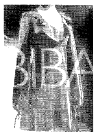
(Fig. 6) Mini dress, Biba. 1968.