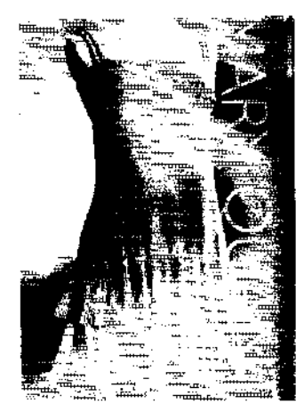
⟨Fig. 5⟩ Mini dress, Mary Quant. 1967 ~ 68.