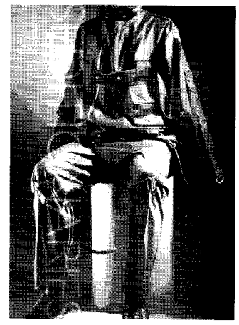
(Fig. 7) Bondage suit, Vivienne Westwood and Malcolm McLaren, 1976.