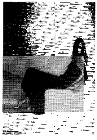
(Fig. 10) In FASHION, 2005 - 6, P27 GUCCL