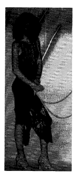
(Fig. 8) Zandra Rhodes' 1977 version was called 'Conceptual Chic'.

Colors take an important part in fashion because they represent impression of dresses<sup>41</sup>.