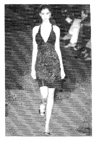
⟨Fig. 11⟩ In FASHION, 2005~6, P43 CHANEL.