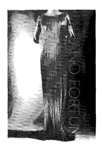
no Fortuny, 1920,

confined to uniforms, the overalls of war-related occupations or remodelled pre-war clothes, while fashion marked time21. The black of mourning was dreaded though on occasion when fabrics became scarce women ran up little numbers in black-out material and were tempted by the fashion offerings of black marketeers. Graphic black has recorded shifts in style perfectly : it eaught the bullishness of the squared-off, wartime silhouette and then, five years later, brought the rounded contours of the conquering New Look into sharp focus(Fig. 4) Christian Dior was a lead player in one of the most active decades