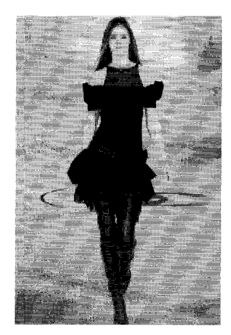
(Fig. 9) GAP, 2006, P20 ALEXANDER Mc-QUEEN,

It seems that dressed in black a woman can be pious, slender, seductive or witchlike: she can