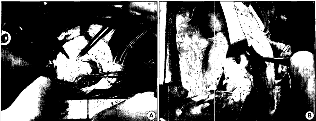
Fig. 2. Operative findings. (A) After right atrium is opened and the device is removed, the opening of the aorta-to-right atrial fistula is shown at the anterosuperior margin of atrial septum. (B) After aorta is opened, the opening of the aorta-to-right atrial fistula is located in the central region of noncoronary sinus in aortic root.

when the anatomy is suitable, principally due to the patient's desire for a "less invasive procedure," and the reputed procedural efficacy and safety. Unfortunately, however, the early complications after implantation of an Amplatzer device are arrhythmias, transient ST-T elevation in the inferior leads, residual shunts, hemolysis, malpositions and dislocations of device, device embolization into the left atrium, right atrium, right ventricle and pulmonary arterial tree, thromboembolization into the central nervous system, peripheral embolization into the leg, injury of groin vessels at the place of a puncture, device impingement on caval veins, on the right upper pulmonary vein, and on the mitral and tricupsid valves, thrombus of the device, infectious endocarditis, and sudden death[3,4]. These complications may require conversion to an immediate surgical repair.