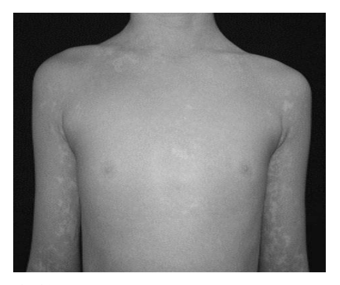
Fig. 2A. Multiple, variably-sized erythematous maculopapular lesions on the trunk & upper extremities.

Progress and treatment: After admission to our hospital, the patient received intravenous antibiotic therapy for 7 days. This, however, did not result in symptomatic relief. On the 9th day of admission, the patient's fever subsided. On the 15th day of admission, he manifested an erythematous maculopapular rash on his face, trunk, and upper and lower extremities (Fig. 2A, 2B). This rash was reminiscent of that observed in association with drug eruptions or rubella. However, the patient had no drug history, and the antibody titers against rubella were negative. After 4 weeks of conservative treatment, the patient's skin lesions