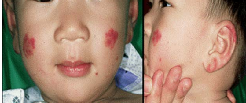
Fig. 1. Bilateral, infiltrated, annular and purpuric lesion of both malar areas of the face and erythematous purpura on the left ear.