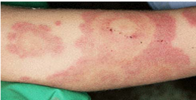
Fig. 2. Multiple targetoid or cockade purpura on lower leg, characteristic of acute hemorrhagic edema of infancy.

serum complements, liver and kidney function tests were all within the normal range.