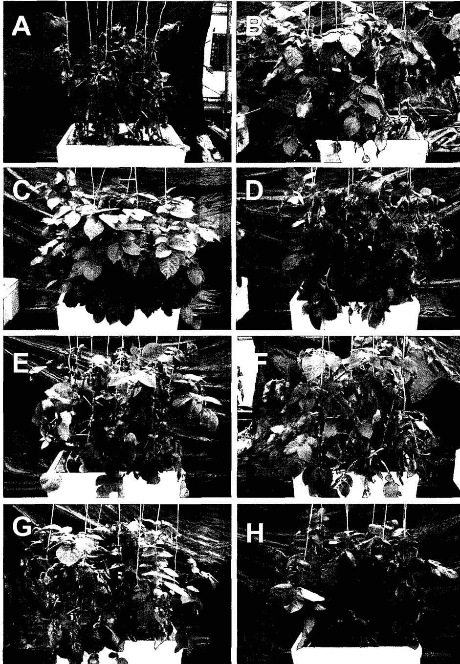
Fig. 1. Induction of systemically induced resistance in potato plants against late blight disease at 14 days after inoculation with P. infestans ( 1.0 \times 10^4 zoospores/ml). The presented plants were (A) untreated control, (B) pre-treated 7 days before challenge inoculation with DL-3-amino butyric acid (BABA; 10 mM), (C) Mancozeb WP (Diesen M ® , 2,000 ppm), (D) pre-inoculation 7 days before challenge inoculation with bacterial suspension of Pseudomonas putida (TRL2-3), (E) Micrococcus luteus (TRK2-2), (F) Flexibacteraceae bacterium (MRL412) with the concentration of 1.0 \times 10^7 cfu/ml each, (G) post-treated 7 days after challenge inoculation with Dimethomorph WP (Forum ® 1,000 ppm), and (H) phosphonic acid (H 3 PO 3 ; 2,000 ppm).

ease severity of late blight was significantly suppressed by the pre-inoculation with all bacterial isolates tested (Fig. 2). Although in the first experiment the protection rate of the TRK2-2 pre-inoculated plants was lower than those of other bacterial isolate pre-inoculated plants, similar protec-