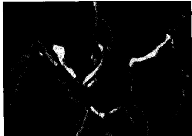
Fig. 1. Computed tomographic angiography demonstrates an unruptured left middle cerebral and right posterior communicating artery aneurysms.

At operation, there was no evidence of recent or old subarachnoid hemorrhage under surgical microscope. The aneurysmal sac had broad neck which involved the parent arteries, and