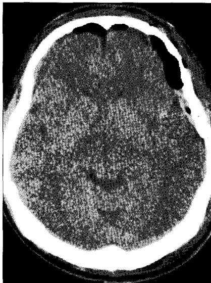
Fig. 2. Postoperative brain computed tomographic scans shows unremarkable findings except small amount of pneumocephalus.

Postoperatively, he recovered well without any neurologic