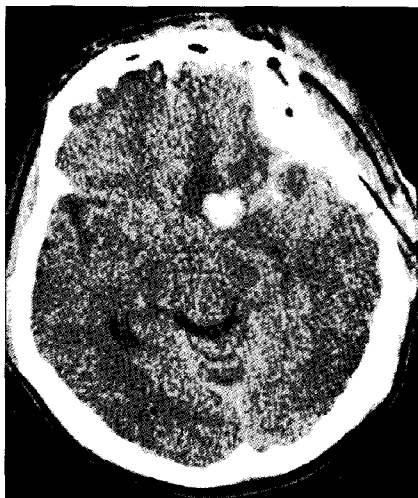
Fig. 3. Brain computed tomographic scans on the third postoperative day demonstrates delayed development of epidural hematoma, small amount of subdural hemorrhage over the distal sylvian fissure and small amount of intracerebral hematoma in frontal lobe.

deficit and his postoperative head computed tomographic scans(CT) showed normal postoperative changes without evidence of hemorrhage except a small amount of pneumocephalus(Fig. 2). He was transferred to general ward after 24 hours period of observation at neurosurgical intensive care unit and he ambulated well.