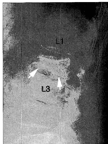
Fig. 3. An example lateral radiograph of an osteoporotic vertebral compression fracture shows radiolucency of the vertebra and an irregularity of the fractured endplate (arrows) in which it is difficult to place uniform landmarks on the film to measure the kyphotic angle.

However, there are many criticisms of using the Cobb method for evaluating kyphotic deformities, such as difficulties in selecting the endplate as a baseline for the kyphosis measurement compared with scoliosis (Fig. 3), the extra possible human error in the four lines required using the traditional Cobb method, and the high interobserver and intraobserver error (5~10°) 4 . Because the Cobb angles were originally drawn on the anteroposterior radiographs, the use of endplate lines to construct the angles on the lateral radiographs are often referred to as the "modified Cobb method." These high measurement errors have also been reported when using the modified Cobb met-