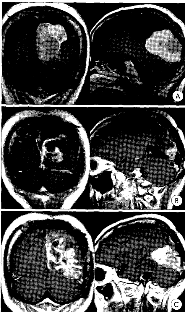
Fig. 2. A : An extra-axial well-enhancing falcine tumor with a dural tail sign in the left parieto-occipital area is identified in September 1999, 11 years after the first surgery. B : An enhancing small mass, implying local recurrence of the tumor at the previous site, is seen 12 months after the second surgery. C : The mass outgrowing the boundary occupied by the tumor before gamma knife radiosurgery with lobulating irregular margins, 10 months after the second surgery.

In our case, initial pathologic diagnosis was a benign fibrous meningioma, but rhabdoid features were evident at the second surgery (the first at our hospital), 11 years after the first operation, when the mitotic activity was moderate and the MIB-1 LI was low, only 1% of tumor cells. The pathologic diagnosis was a rhabdoid tumor at that time before rhabdoid meningioma was classified as a malignant variant in the recent WHO classification. However, highly proliferative typical rhabdoid features of malignancy were present at the third surgery. The more the tumor was treated, the more malignant it seemed to be.