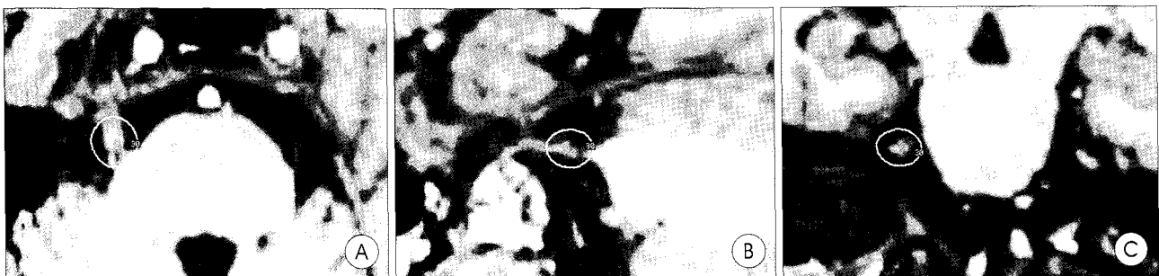
Fig. 1. This picture depicts Gamma knife radiosurgery targeting for trigeminal neuralgia. The root entry zone of the trigeminal nerve was targeted so that the 30% isodose surface contacted the edge of the pons. The circle represents the 30% isodose curve. (A : Axial image, B : Sagittal image, and C : Coronal image).

Statistical evaluations were performed using commercially available statistical software (SPSS version 10.0, SPSS Inc.). Descriptive statistics were computed using standard methods of calculating median or mean values. Univariate and multivariate analyses were performed to assess variables predictive of a pain-relief outcome and pain recurrence after GKS. For group comparisons of categorical data (nominal data or ordinal data), the two-tailed Fisher's exact test and Pearson's chi-square test were used. The unpaired Student t-test was used for continuous variables. In all cases, two-tailed probability values were calculated and statistical significance was defined as a probability value of less than or equal to 0.05.