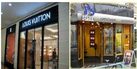
<Figure 3> Brand shops on the Champs-Elysees in Paris

The management policy for signboards in France focuses on harmony with the surrounding architecture and streetscape. Colours are limited to achromatic hues such as white and grey. On the Champs-Elysees in Paris, there are no signboards with colours such as gold lettering on a red background in order not to spoil the urban landscape with its many cultural assets.