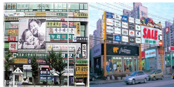
<Figure 2> A chaos of signboards and rearranged signboards