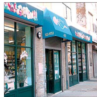
<Figure 7> A shop on Myrtle Avenue with an improved signboard

The influence of beautiful signboards is clearly evident in Myrtle Avenue, Brooklyn, New York, which is in the middle of a signboard improvement project. This street, which was crowded with signboards with colourful letters, began to change from January 1999 when the residents agreed to the Myrtle Avenue Revitalization Project (MARP) with the motto 'Clean Street, Pretty Signboard'. 26)