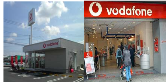
<Figure 6> Vodafone's changed logo(right) 25)

2003 Vodafone, a British cell phone company, voluntarily changed their company logo. The original logo had white letters on a red background but the company reversed this to red letters on a white background. The city has succeeded in establishing a culture of attractive signboards.