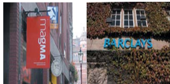
<Figure 1> Simple brand images on building walls in London