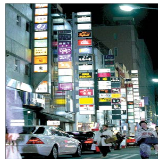
<Figure 5> Night on Ginza, best entertainment street in Japan

The Ginza in Tokyo, the best entertainment area in Japan, is densely crowded with thousands of 'clubs'. However, colourful illuminating neon lights or flashing light signboards are non-existent on the street. Only projecting signboards in similar colours and of a uniform size hang on the walls of buildings. The well-arranged signboards do not tire the eyes of pedestrians. There are no standing signboards to hamper passage, nor placards to obstruct vision. The reason becomes clear when we consider how the improvement was carried out: the district office did not impose regulations on colours and sizes of signboards; rather, 20 years ago, the residents themselves took the initiative to beautify the street.