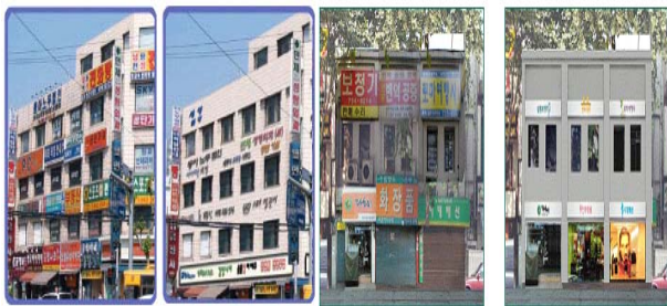
<Figure 4> Improved signboards in Seoul Before Arrangement After Arrangement

According to a recent survey, only 11.6% of stores had "over 80 customers a day on weekdays" before the street arrangement. After the improvements, the percentage greatly increased to 52%, and on weekends, it increased to 70% from the previous 30%. The effectiveness of the project can be seen in the case of 'Shim', a shop specializing in women's clothes. In 2003, sales in the branch shops on the high street in Munjungdong and Mokdong decreased by 10 per cent and 25% respectively compared to the sales in 2002. However, the branch shop on Noyu Street saw an increase. The value of real estate on the street has now doubled.