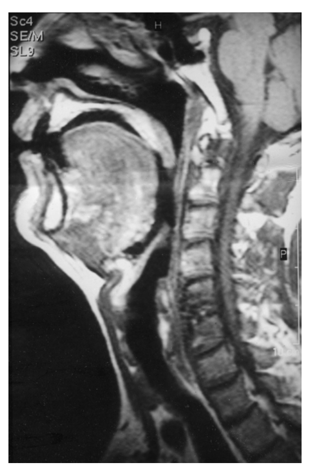
Figure 2. MRI of the head and neck showing that the uvula contacted the posterior nasopharyngeal wall during the expiratory phase of breathing.

On physical examination, a noise sounding rather like a krrrrr was detected during expiration. His lungs and heart were normal. Radiographs of the chest and paranasal sinuses showed no evidence of abnormality and a pulmonary function test showed minimal obstructive ventilatory dysfunction, but interestingly, flexible fiberoptic nasopharyngoscopy (Fig. 1) and magnetic resonance imaging of head and neck (Fig 2), found that the uvula reached the posterior nasopharyngeal wall during the expiratory phase of breathing, which suggested a possible case of the paradoxical upper airway obstruction. Overnight sleep studies were also performed using stand-