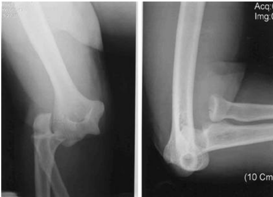
Fig. 1. Initial radiographs show a simple anterolateral dislocation of the elbow.

backward force was applied to the forearm, the elbow appeared to be reduced with a clunk being heard. The passive motion of the elbow was fully restored and the elbow joint was stable in the range of motion. The subjective power of the adduction and abduction of the fingers was unaffected, but there was still reduced sensation of the two ulnar digits. The radiographs taken after the closed reduction revealed a complete reduction without abnormal findings (Fig. 2). MRI was taken to identify the pathoanatomy and to decide if surgery is needed. MRI revealed the medial collateral ligament and the lateral collateral ligament were injured, but the bony structures were preserved (Fig. 3). And there were partial tear of the brachialis muscle, well preserved biceps and triceps muscle, and diffuse edema of soft tissue in posterior part of the elbow (Fig. 4).