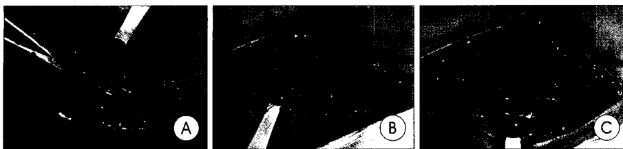
Fig. 2. Intraoperative photographs of the posterior interosseous nerve (PIN) syndrome patient. (A) Note the vascular leash and adhesive bands constricting the PIN across it at the just proximal to the arcade of Frohse. (B) The abnormal crossing veins which across the PIN are coagulated and tied. (C) After division of the vascular leash and bands, arcade of Frohse is excised widely for an adequate nerve decompression.