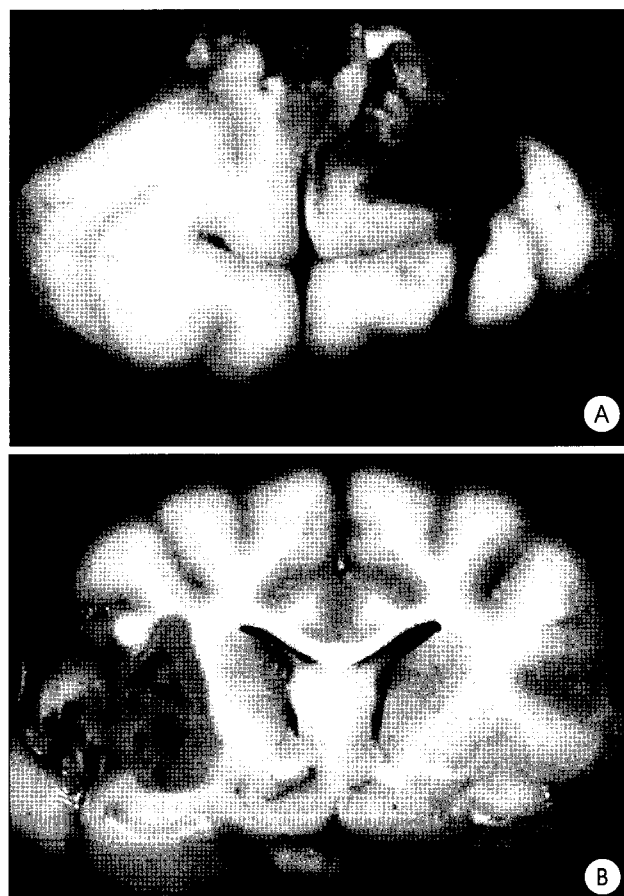
Fig. 1. A : Coronal slices show remained clots in the saline treated group. B : There are a few clots of recombinant tissue plasminogen activator treated group.

In the control group, the residual hematoma was 1.86 ± 0.12 ml. In the first group, the residual hematoma was 1.63 ± 0.32 ml, in the second group 0.91 ± 0.47ml, in the third group 0.73 ± 0.36ml, in the fourth group 0.75 ± 0.21ml and in the fifth group 0.67 ± 0.38ml. The amount of residual hematoma in the control group was 1.87 ± 0.11ml and in five groups of rt-PA was 0.9 ± 0.34ml. There were significant differences between control and rt-PA groups except the first rt-PA group (P<0.05, Table 2).