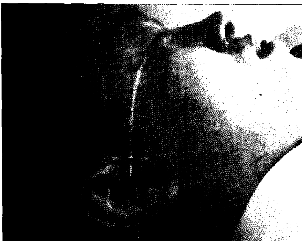
Fig. 1. Orbitomeatal line : A Line from the lateral canthus to the external acoustic meatus.

Statistical analysis was performed using SPSS for Windows (version 11.0, SPSS Inc.). The paired t-tests were used for the comparison of the differences between right and left and two sample t-test was used for the comparison between sex groups. P value of <0.05 was considered significant.