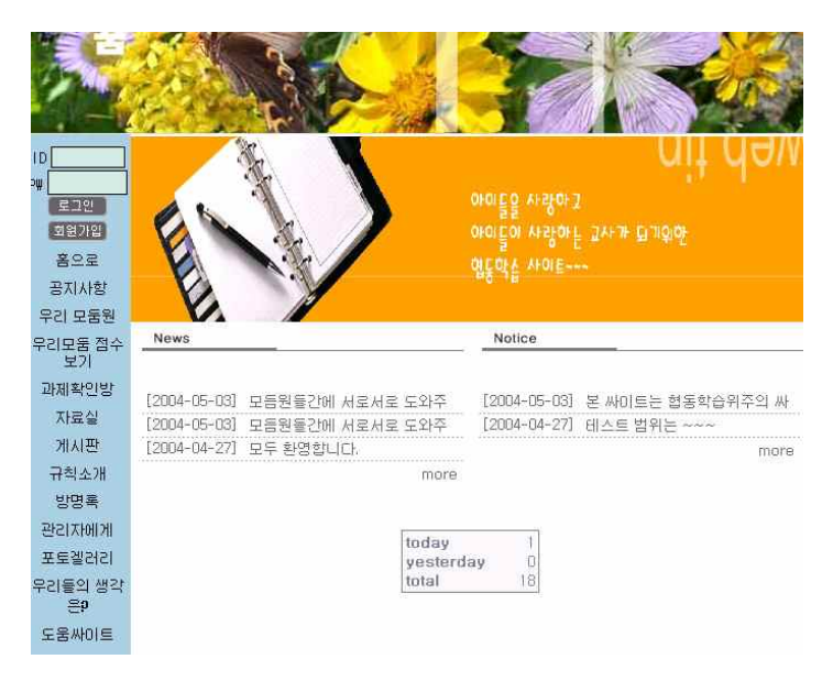
Figure 2. Main Page

allowed to participate in the learning and to know which member already got in the system. Also you can take a test and leave your output in the bulletin board with your ID. Every ID for all the users can be only given by passing this window.