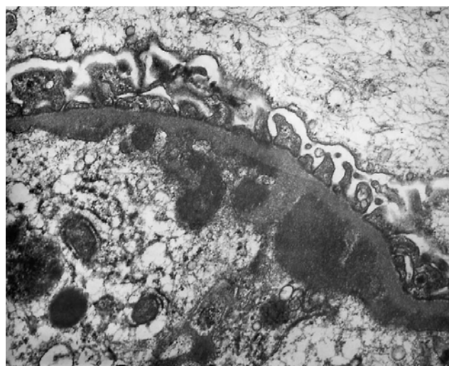
Fig. 3. Electron microscopy showing diffuse subendothelial electron dense deposits ( \times 50,000 ).

On the third day of hospitalization, blood pressure increased to 130/90 mmHg. Because severe proteinuric HSP nephritis was diagnosed, alternate-day intravenous high-dose methyl-prednisolone therapy (30 mg/kg/day) and angiotensin converting enzyme inhibitor were started from on the fourth day of hospitalization. Thereafter, his urine abnormalities gradually improved. Serial 24-hr urine protein excretion performed on the ninth, thirteenth, and seventeenth hospital days were 5,355 mg/dL, 4,680 mg/dL, and 3,300 mg/dL, respectively (Fig. 1). Although the severity of the proteinuria was improved, proteinuria remained. We changed intravenous methylprednisolone to oral cyclophosphamide because hypertension was probably worsened with high dose intravenous steroid.