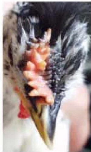
Figure 2. A phenotypic chimeric bird (feather, tibia, digiti, and crown).

difference was slight when exceeding 6 h of transfection (group 9). Seen under a IFM after 6 h of transfection, there was no green light in group 10, and the signal was weak in group 8. No increment of green cells was found when the BCs were cultured for additional 12 h with serum (groups 4, 5, 6 and 8). In groups 5 through 8, 8% cells that were