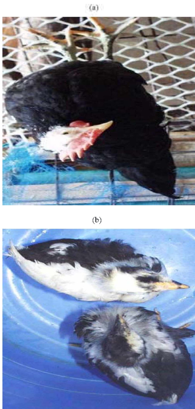
Figure 3. Phenotypic chimeric birds: (a) the whole body was black except the white head, (b) phenotypic half-chimerism.

used in model 2. One chimeric rooster was obtained in group 4 (no irradiation) with 25% feathers being black. In groups 5, the ratio of total chimeras (including dead embryos) was 23% and that of living chimeras was 17%. There were 2 chimeras that exhibited 50% of the phenotypic characters of the donor and another 2 chimeras that exhibited more than 90% of the phenotypic characters of donor. Figure 2 showed a chimeric bird whose the right body was black and the left body was white. A similar result was previously reported by Trefil (1997). We obtained 6