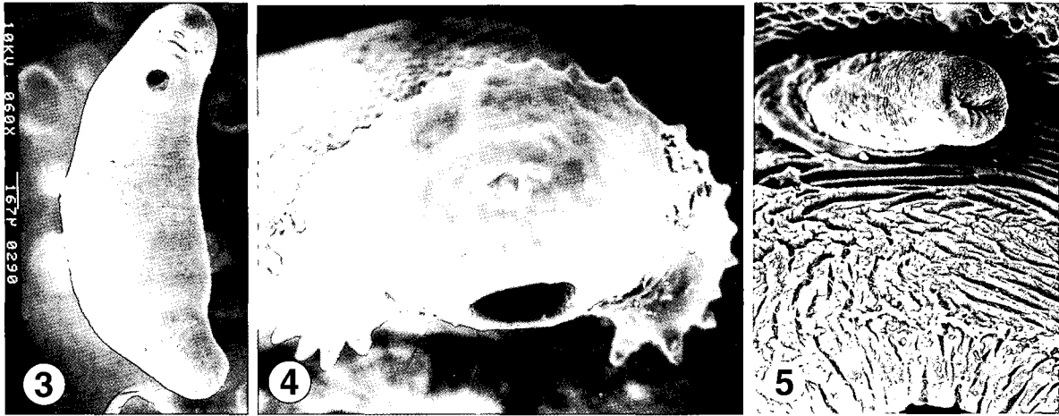
Figs. 3-5. Scanning electron micrographs of an Echinostoma hortense specimen retrieved from the patient. Fig. 3. Ventral view. Fig. 4. The oral opening and head crown spikes with collar spines. Fig. 5. The cirrus erected from the genital pore anterior to the acetabulum.