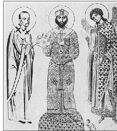
<Fig. 4> Nicephorus Botaniates(The Book of Costume)