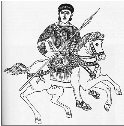
<Fig. 1> Early Byzantine garment (History of Costume)