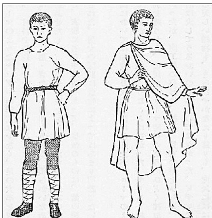
<Fig. 3> Populace garment (History of Western Costume)

but the emperor could put the crown, and footwear were shown as shoes and sandals, those of the royalty were in splendor. Ornaments like a belt or a tablion were used to show position.