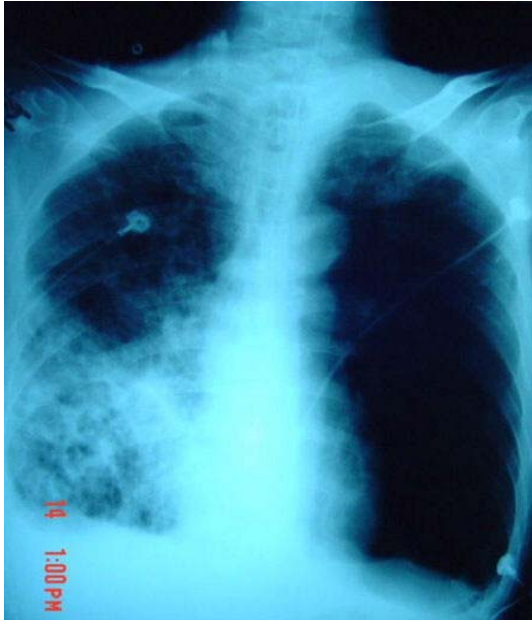
Fig. 3. The consolidation observed on the chest radiograph on the 10th day decreased, although pneumonic infiltrations and areas of cavitation were still present

septicemia. However, on Day 12, the patient suddenly lost consciousness and a hemodynamic collapse, which culminated in pulseless bradycardia, ventricular fibrillation and death.