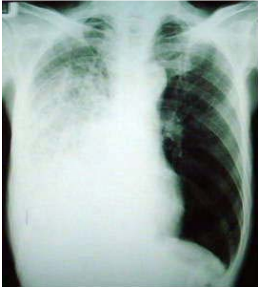
Fig. 2 Posteroanterior chest radiograph 3 days after admission demonstrating increased opacification in the right lower zone

shortness of breath became progressively worse over time, despite the intermittent use of an epinephrine and ventolin nebulizer for dyspnea.