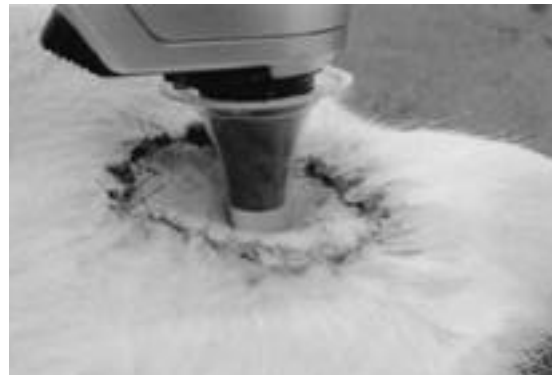
Fig. 4. Checking the temperature of the flaps