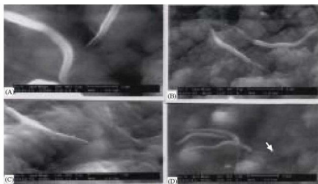
Figure 4. In vitro fertilization process observed under ESEM. (A) 5 min after in vitro fertilization, (B), (C) and (D) 15 min after in vitro fertilization.

sperms were found to be penetrating one ovum simultaneously (Figure 4C, 3D), and one sperm was found to have almost entered into the ovum but its tail left outside (Figure 4D, arrow).