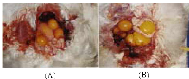
Figure 2. A dose-dependent induction of ova with CAPE injection. (A) one ovum (arrow) was ovulated in a hen treated with 100 mg CAPE. (B) three ova (arrow) were ovulated in a hen treated with 200 mg CAPE.

When hens were sacrificed at 7.2 h after CAPE or ACAPE injection, no ovulation occurred in most hens except for one, which began multiple ovulations about 6 h after injection of ACAPE. However, multiple ovulated ova were found in the infundibulum or body cavity at 7.5 h post