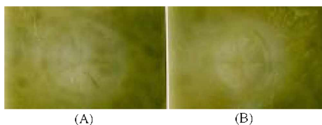
Figure 3. Early development of the multiple ovulated ova after in vitro fertilization. (A) 4 cell stage, (B) 16 cell stage.

injection. At that time, most hens had one ovum captured in the infundibulum and another one or two located in the body cavity. Two ova rarely resided in the infundibulum simultaneously.