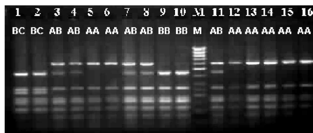
Figure 2. The genotyping results of NRAMP1 gene by PCR- Hinf I-RFLP. Lane 5, 6, 12, 13, 14, 15 and 16: genotype AA; lane 9 and 10: genotype BB; lane 3,4,7,8 and 11: genotype AB; Lane 1 and 2: genotype BC; M was GeneRuler ™ 50 bp DNA Ladder marker.

PCR products were purified with the QIAquick PCR Purification Kit (QIAGEN, Hilden, Germany) and sequenced directly with two PCR primers using the ABI PRISM ® BigDye ™ Terminators v3.0 Cycle Sequencing Kit