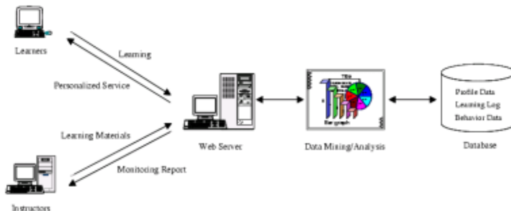
Figure 1. The structure of the LRM environment/system

LRM is a process to accumulate the learning behavior data of learners, to grasp learning patterns and to apply these patterns in learning activities. As mentioned in Aggarwal and Bento (2000), there is no denying that Web-based courses open new educational access to non-traditional and geographically dispersed students. However, quality is one area where Web-based education often comes under heavy criticism and many students seek on-line courses driven by personal situations. To offer students equal or better quality learning as the traditional face-to-face environment, the LRM process is expected to serve a significant role.