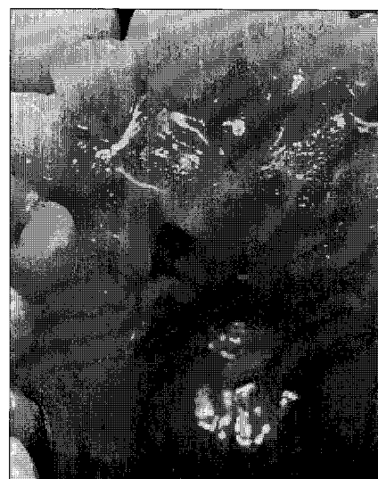
Fig. 4. Two weeks following surgery