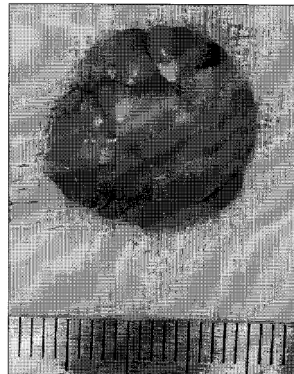
Fig. 2B. Removed mass sized 3cm in diameter