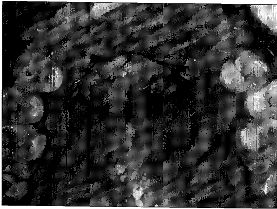
Fig. 1. A fibroma growing on the palate

2A-B). The histopathologic findings included dense collagen with areas of hyalinization and a paucity of blood vessels and the covering of the entire lesion by stratified squamous epithelium(Fig. 3).