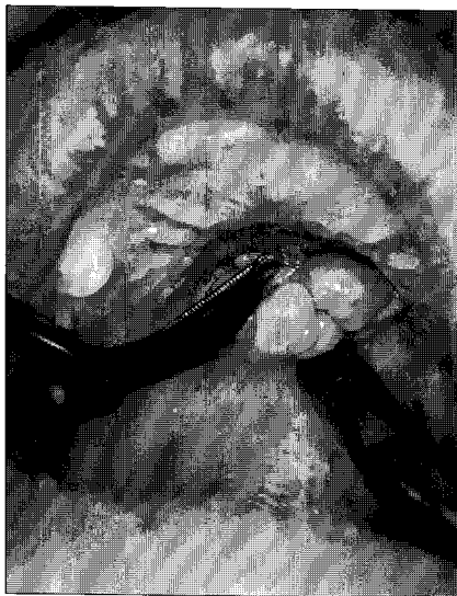
Fig. 2A. Excisional biopsy being performed by electrocautery unit

A state of good healing was evident at the follow up of 2 weeks(Fig. 4) and no recurred lesion has been detected for 4 years.