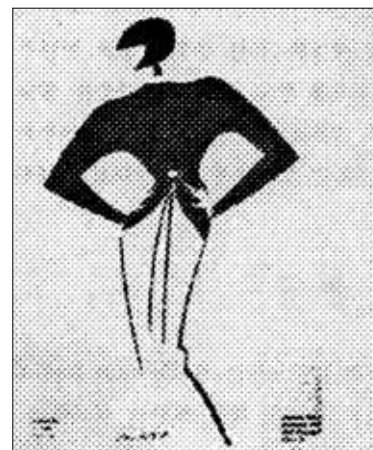
<Fig. 9> Mats Gustavson, 1983, Fashion Illustration today

paint and the collage techniques using paper and screen tone.