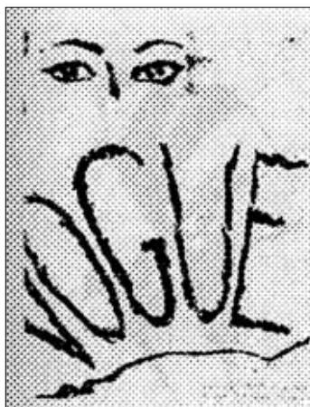
<Fig. 4> Eric, 1931, Fashion Illustration in vogue