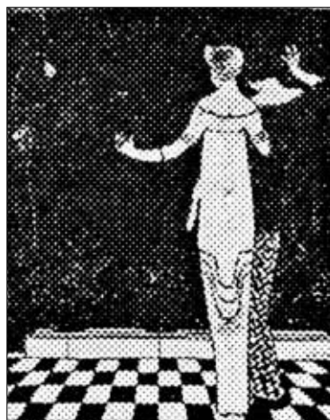
<Fig. 2> Gerge Lepape, 1911, Fashion Illustration