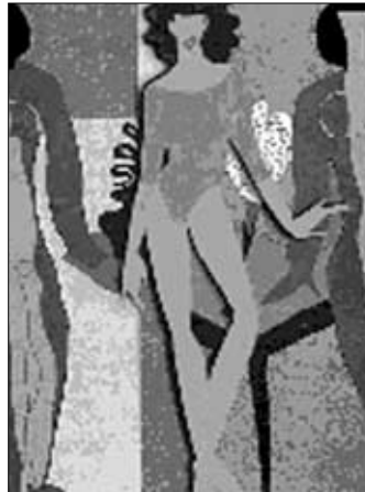
<Fig. 16> Kang Hee Myung