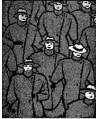
<Fig.13> Francois Berthoud Fashion Illustration