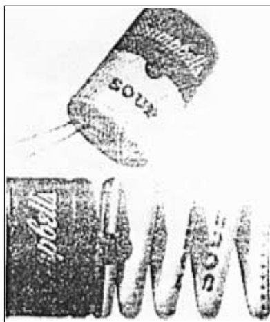
<Fig. 24> The Creative Illustration book, 1995