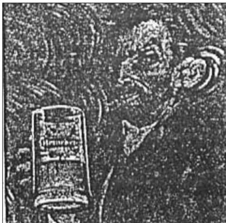
<Fig. 28> The world of Design ,1993