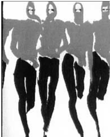
<Fig. 10> Tonu viraman, Fashion Illustration

It's the expression technique to spray ink for