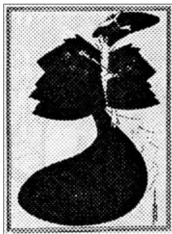
<Fig. 1> Aubrey Beardsley, Fashion Drawing in Vogue