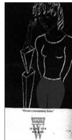
<Fig. 25> Levis series of advertisement

of formative visual languages. Therefore, symbol is very important formative means in Illustration. 10)