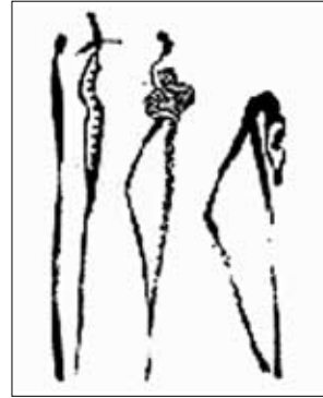
<Fig14> BELVEDRE FASHION LOOK