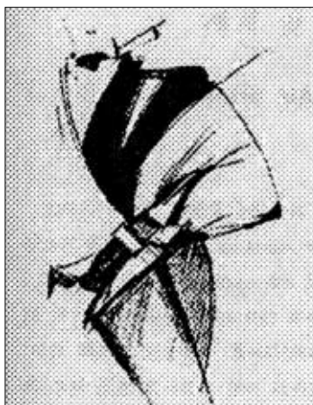
<Fig. 8> Gianfranco Ferré, 1982, Fashion Illustration