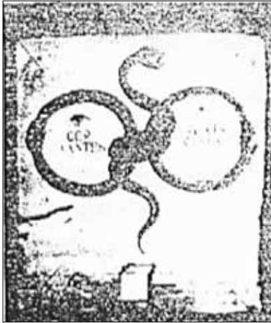
<Fig. 26> The History of Graphic Design, 1997