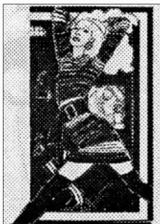
<Fig. 7> Antonio, ANTONIO 60.70.80