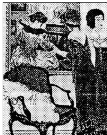
<Fig. 3> Paul Irvie, 1908, Fashion Illustration

effect on fashion illustration as well as on the style of Art Deco. In this regard, the color theory of Fauvism was expressed to be bright and splendid and the shape theory of Cubism was shown to be plane and geometric screen composition of.