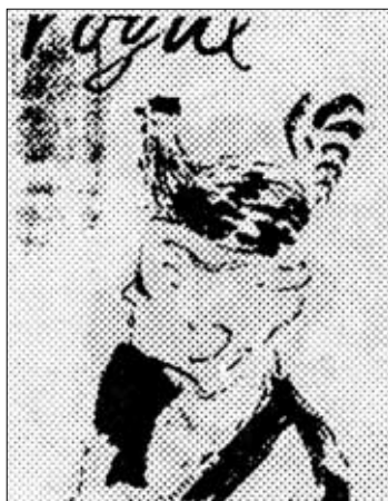
<Fig. 5> Eric, 1938, Vogue Fashion and Surrealism