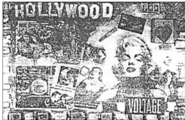
<Fig. 29> American Showcase 21st edition Illustration book 2, 1998