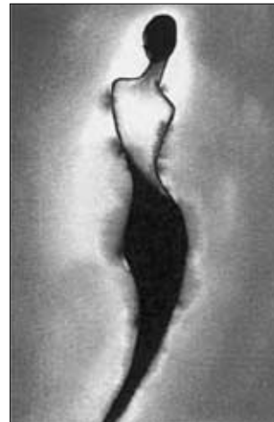
<Fig. 11> Kareem liya, Fashion Illustration

Indian ink, the oriental painting technique with a