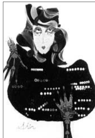
<Fig. 22> Cho.Sun.Ohk ,2000