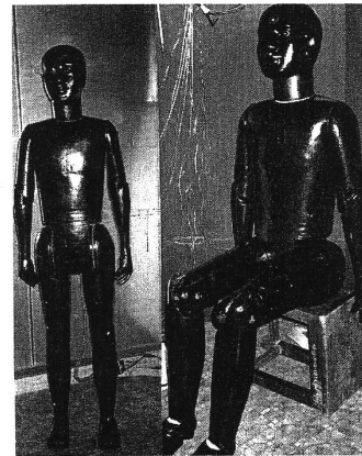
Fig. 1. The nude thermal manikin in standing/seated pose

Jump suit made of cotton medium plane with a little