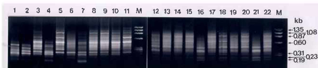
Figure 1. RAPD profiles of crucian carp ( Carassius carassius ) amplified by arbitrary primer OPA-02 (TGCCGAGCTG). Amplification products were electrophoresed on a 1.4% agarose gel with TBE (0.09 M Tris, pH 8.5, 0.09 M boric acid, 2.5 mM EDTA) and detected by staining with ethidium bromide. The gels were illuminated with UV light and taken photographs by photoman direct copy system. Each lane shows different individual DNA samples consisting of wild population (No. 1-11) and cultured (No. 12-22). M: Molecular size standard ( \Phi X174 DNA marker digested with Hae III).

identical band patterns of PCR-RAPD products were observed from 0.23 to less than 0.60 kb. The identical bands from 0.28 to less than 0.60 kb generated by random primer OPA-03 were also observed in figure 2. Especially, although this primer showed a few dense bands in comparison with other primers, there were shown a great variety of specific minor bands. The similar minor band patterns of PCR-RAPD products generated by random primer OPA-05 that were observed ranged from 0.23 to 1.35 kb in the cultured population (figure 3). This primer