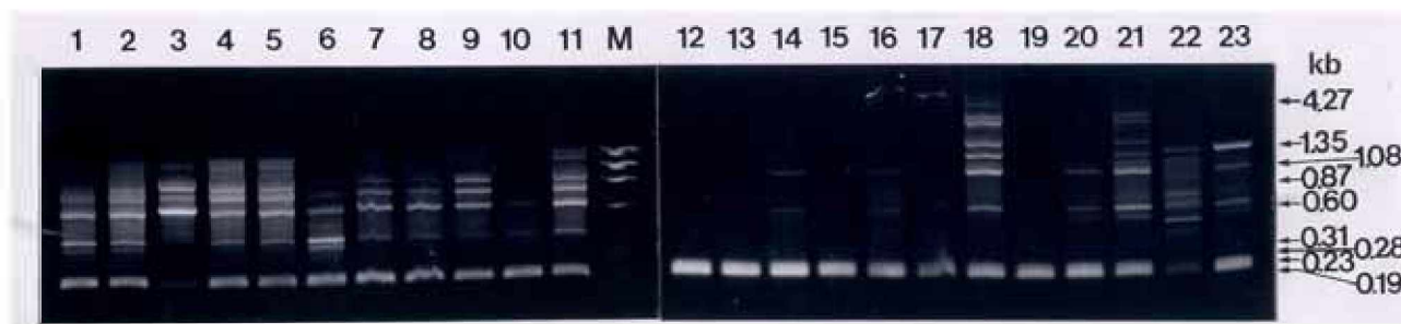
Figure 4. PCR-RAPD products of crucian carp generated by arbitrary OPA-07 (GAAACGGGTG). Each lane shows different individual DNA samples consisting of cultured population (No. 1-11) and wild (No. 12-23). M: Molecular size standard ( \Phi X174 DNA marker digested with Hae III).

The RAPD profiles obtained from individuals of the two populations were found to differ in bandsharing value. The average percentage of poly-morphic markers was much higher in the wild population, compared to the cultured population, although the total and average of band numbers