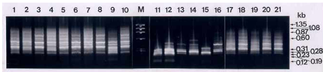
Figure 3. Individual specific RAPD patterns in crucian carp amplified by arbitrary OPA-05 (AGGGGTCTTG). Each lane shows different individual DNA samples including cultured population (No. 1-10) and wild (No. 11-21). M: Molecular size marker ( \Phi X174 DNA marker digested with Hae III).