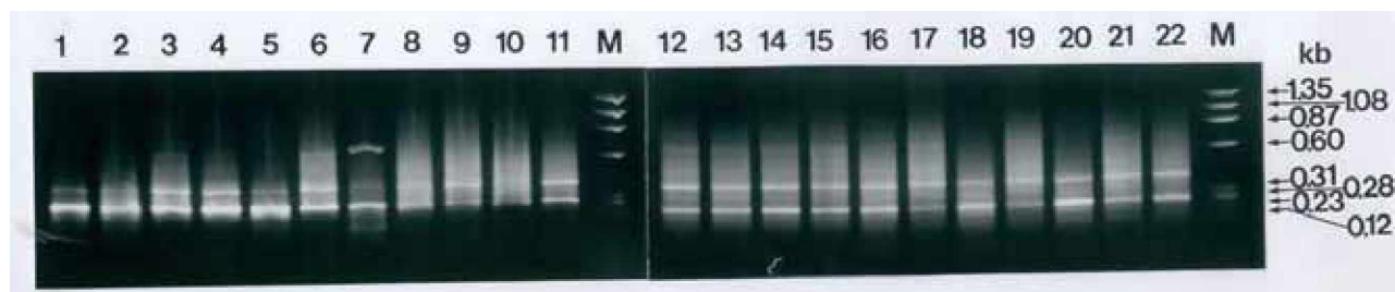
Figure 2. Specific RAPD patterns of crucian carp generated by arbitrary primer OPA-03 (AGTCAGCCAC). Each lane shows different individual DNA samples containing wild population (No. 1-11) and cultured (No. 12-22). M: \Phi X174 DNA marker digested with Hae III.