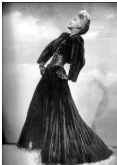
<Fig. 3> Ginger Rogers in <Lady in the Dark>(1944) <Fashion in Film> p.47

Women's representation as a subject of modern consumer related to this symbolic value of fur. In the late Nineteenth Century, the consumer was represented solely as women, participating modern experience by taking responsibility for purchasing. A woman was described as a passive human being, seduced by glamorous phantasm of newly arrived consumer culture. The monumental gate of the international exposition held in Paris in 1900, for example, was decorated with a flying figure of a Parisien woman, wearing tight skirt, ship-shaped headdress symbolizing the city of Paris, and evening coat made of faux fur. 28) Women's desire for commodity was considered as legitimate, though trivial, officially acknowledged as an acceptable form of desire, which retailers and tradesman tried to stimulate with allures of extravagant window displays. Having lost her