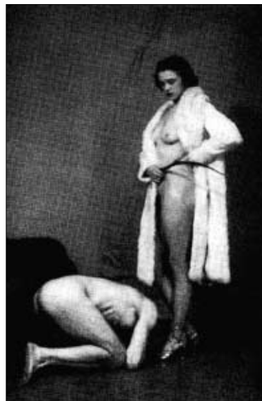
<Fig. 2> Man licking the Shoe of a woman in a fur coat, ca. 1937 <Fetish> p.145

The hierarchy of furs and social class created by these regulatory measures also influenced the notions of sexual propriety among different classes of women. Acts forbidding prostitutes to wear fur were an attempt to set a moral order. In terms of sexual morality, the distinction between the 'respectable' and the 'fallen' women was regarded with significance. A British Parliamentary ordinance of 1355 attempted to police this distinction, saying no known whore should wear any hood or fur. 20) Its fundamental purpose is evidently to protect the morals of the community by forcing prostitutes to wear distinctive clothing, so that everyone might be able to distinguish them from the respectable women citizens.