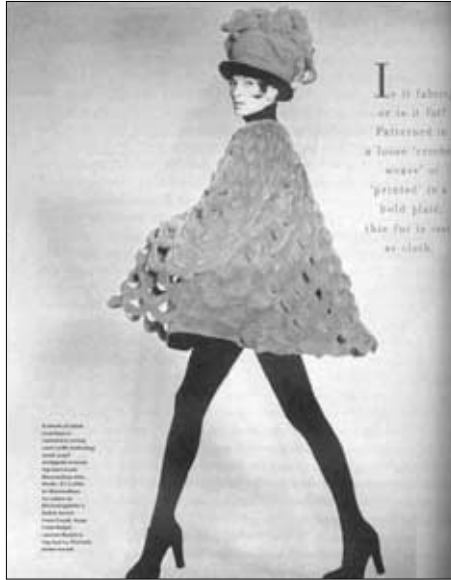
<Fig. 5> "Furs in Disguise"(1992) Maximilian Alta Moda <New York Times Magazine> 9/27/1992