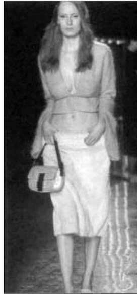
<Fig. 6> Fendi 99 a/w. Milan collection. <Vogue Korea> 1999. 5