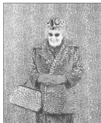
<Fig. 8> Mother in Camouflage, Judy Olausen <The Cultural Politics of Fur> p.135

commented. 39) Judy Olausen's parodic images of a 1950s-style representation of women in fur are one of the examples. These images bring us closer to the dialectics of pleasure in their representation of the sterility of mass media images