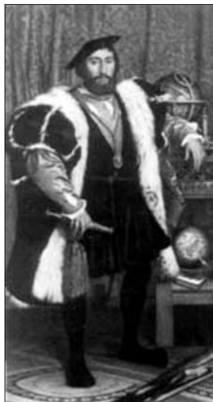
<Fig. 1> <The Ambassadors> (1533) by Holbein. <Costume and Fashion> p. 84