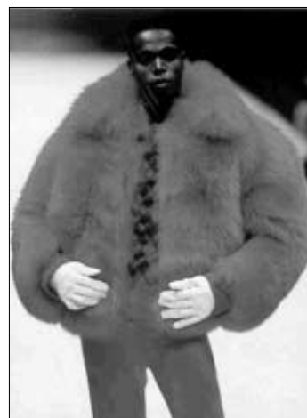
<Fig. 11> Vivien Westwood (1996), <The Man of Fashion> p.188

of white middle-class women depicted as agents of consumerism. 40) <Fig 8>