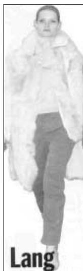
<Fig. 12> Helmut Lang 99 a/w. <Vogue Korea> 1999. 5