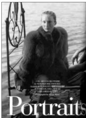
<Fig. 9> Givenchy Fox fur jacket <Vogue Korea>. 1998. 10