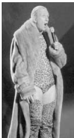
<Fig. 10> Gaultier, J. P. at MTV Awards in 1995. <Fashion Today> p.86