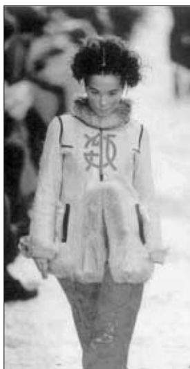
<Fig. 13> Gaultier <Fashion Today> p. 347