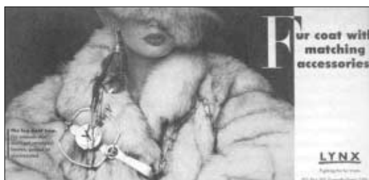
<Fig. 4> Lynx Anti-fur Poster(1984) <The Cultural Politics of Fur>. p.25

The media campaign set out to implicate the cruelty to animals not only the fur industry but, by virtue of her complicity in wearing a fur coat, the female bourgeois consumer. Hanif Kureishi incorporated the anti-fur attack on women into his screenplay for Stephen Frears' film <Sammy and Rosie Got Raid>(1987). Near the conclusion, the feminist, anti-imperialist and lesbian activist in the film crosses behind the property developer's wife and spray-paints and "X" on the back of her long sable coat. Here the figure of the white, heterosexual, fur-clad bourgeois woman was "a feminist allegory on the limits of gender in representing economic violence capital-intensive property development, an accessory to the crime of exploitation and oppression". The figure of the fur-clad bourgeois woman holds a remarkable degree of symbolic power. 32 )