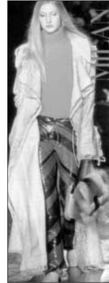
<Fig. 7> Fendi 99 a/w. <Vogue Korea> 1999. 5.

meanings of fur coat as an expensive female item, as fur was shown as an accent in small detail.