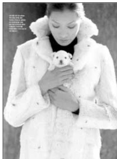
<Fig. 14> YK038, fur from rabbit. <Vogue Korea> 1999. 1

question existed symbolic values of fur.