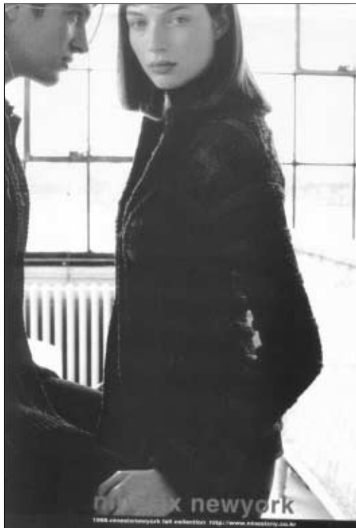
Fig 1. Advertisement expressing eroticism as a direct expression(Nov. 1999, Ceci)

<fig.1> is an erotic-expressed advertisement, which associates the sexual act directly from the models pose and images. Signifiers are divided into surrounding, color, position, facial expression, eye position, and hair style. This ignores the traditional gender roles and disregards the difference between genders and directly symbolizes the sexual act of a new generations identity.<index 1>