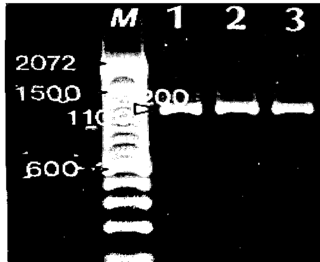
Lane 1: Hanwoo Lane 2: Korean Holstein Lane 3: Imported beef breed