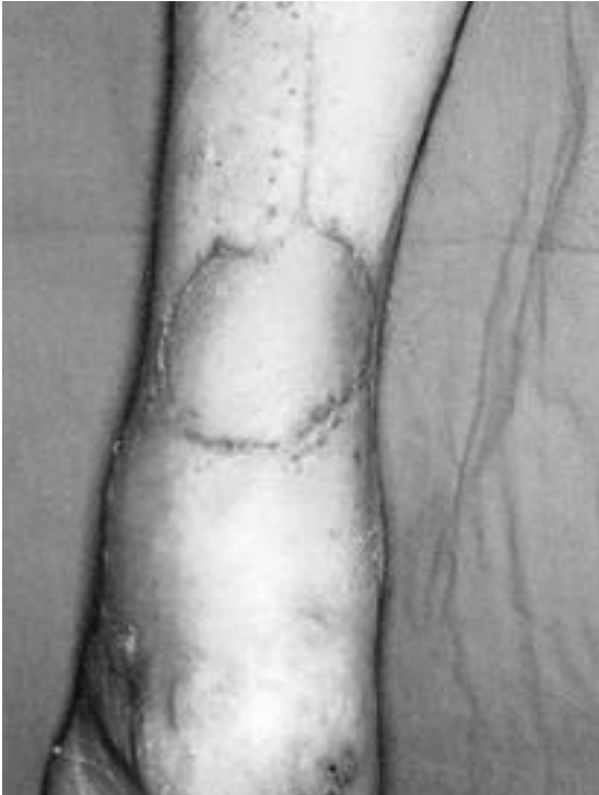
Fig. 5. Postoperative view after one year of surgery.