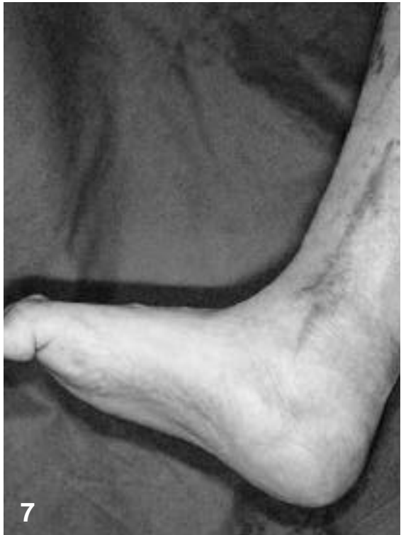
Fig. 6, 7. Dorsiflexion and plantar flexion was achieved.