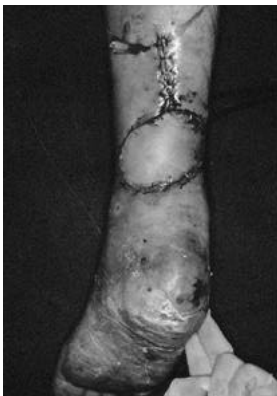
Fig. 4. Immediate postoperative view.

8cm , 6×8cm Achilles 2, 3, 4 (Fig. 2, 3). 가 (soleus muscle) (gastrocnemius muscle) prolene #2-0 Achilles (saphenous nerve) #10-0 nylon (Fig. 4).