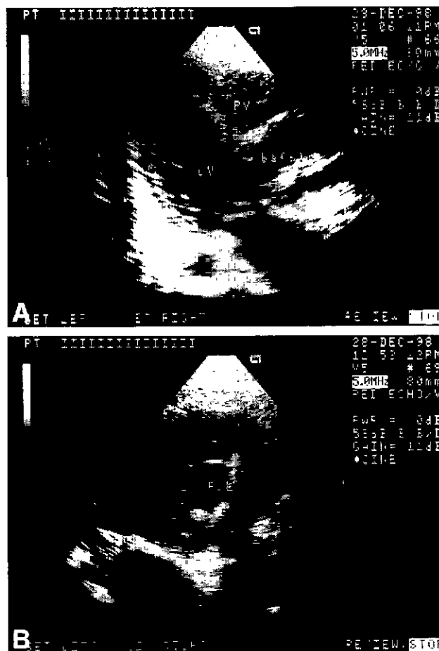
Fig. 2. Postoperative transthoracic echocardiographic view of the left ventricular outflow tract demonstrating unobstructive intraventricular rerouting tunnel (A) long-axis view, (B) cross-section view.

The trabeculations in the course of tunnel of the right ventricle were obliterated primarily with pledget-supported