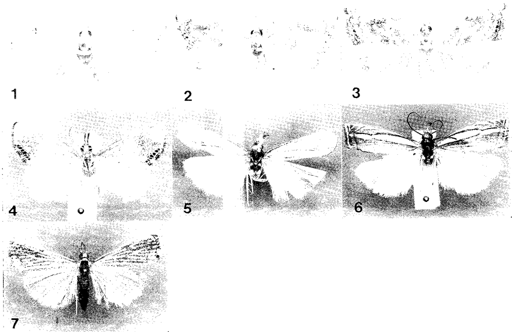
Figs. 1-7. Adults: 1. Glaucocharis electra Bleszyński; 2. G. copernici Bleszyński; 3. G. moriokensis (Okano); 4. Miyakea expansa (Butler); 5. Crambus pseudargyrophorus Okano; 6. C. silvellus Hübner; 7. Flavocrambus picassensis Bleszyński.