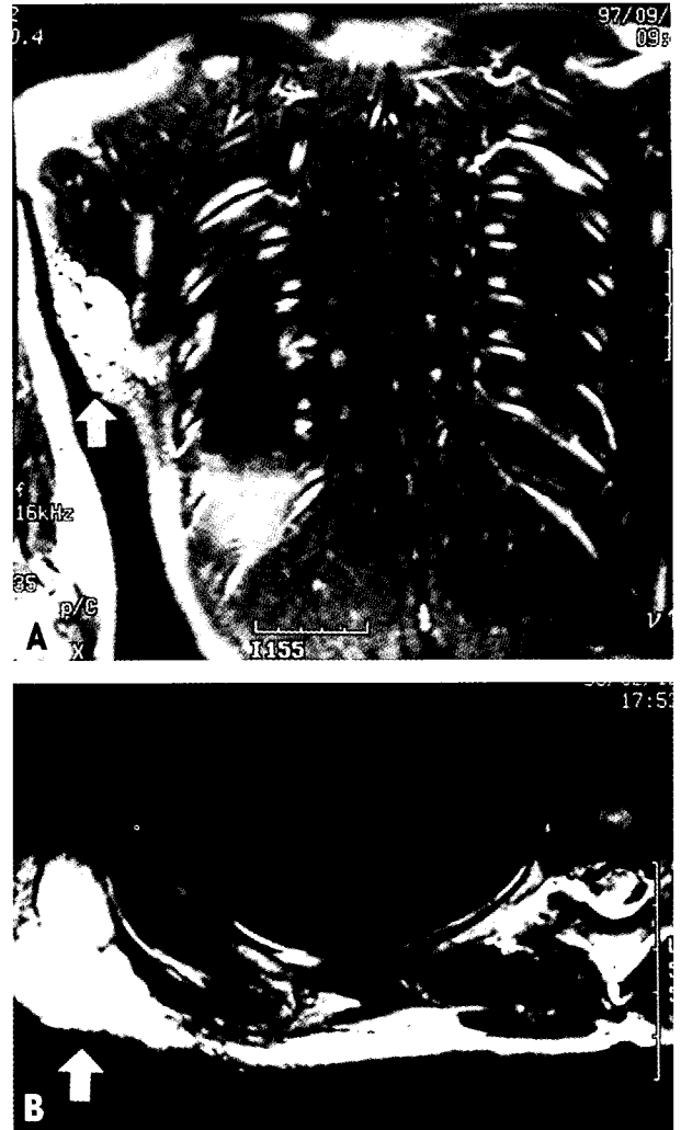
Fig. 2. Chest magnetic resonance findings (A; coronal section, B; transverse section) in T2-weighted image: Multilobulated high signal intensity mass was located between the subcutaneous layer and the muscle layer (arrow).

Lymphangiomas or cystic hygromas are considered to be soft, cystic tumors first described by Redenbacher in 1828. In 1959, the first report of a lymphangioma of the chest wall was made by Fuller and Conway 1) . The incidence is quite low, and no sexual discrepancy of incidence 2) exists. Most of these lesions are detected in the younger groups with about 65% to 75% diagnosed at birth, and 80% to 90% at two or three years of age 3) . In our case, the patient developed a small chest wall mass at one year old which very slowly continued to grow until she was 16 years old. The most commonly affected sites are the neck and axilla. A review of the literature showed that about 75% of the lymphangiomas occurred in the neck and 20% in the axillary region. Other locations include the mediastinum, retroperitoneal space, abdominal viscera, bones, pelvis, inguinal area, and chest wall 2-6) . The reasons for this condition are congenital malformations of the lymphatic system resulting from a failure of the lymphatic sac to join the venous drainage system. A cystic formation occurs due to the absence of communication between the lymphatic and the venous systems. According to Kennedy's 1) classification of lymphangiomas consisting of superficial cutaneous, cavernous, cystic hygroma, and diffuse systemic lymphangioma, our case belongs to the cavernous type. A