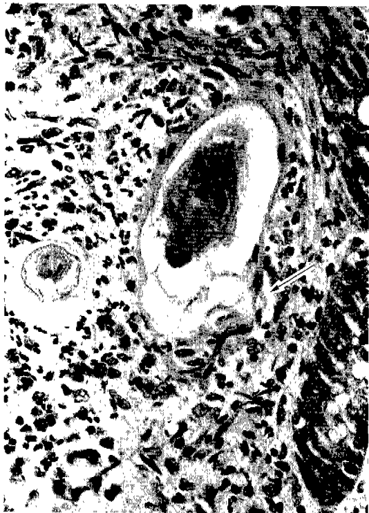
Fig. 3. Close up view of S. mansoni eggs, one egg shows a characteristic lateral spine of the shell (arrow) and miracidium in the center, original magnification, \times 400 .

endemic areas gives helpful diagnostic hint for schistosomiasis. The present case is another example of imported schistosomiasis of the intestine in a Korean man.