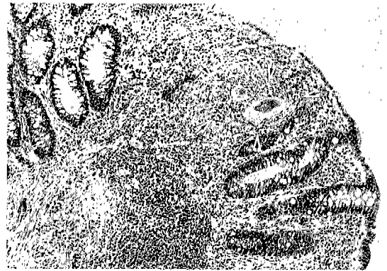
Fig. 2. Microscopically the rectal mucosa is chronically inflamed and contains a focus of egg granuloma (arrows), original magnification, \times 100 .

7 granulomas were seen in serial sections of the 4 biopsy fragments. The granulomas were largely comprised of epithelioid cells with sprinklings of lymphocytes, eosinophils and some multinucleated Langhans giant cells. The center of each granuloma showed an ovoid egg often containing miracidium (Fig. 2). Some eggs were cut across and some were degenerated. The eggs measured 130 \times 60 \mu\text{m} in average size. They had yellowish-brown transparent shell and no operculum. One longitudinally sectioned egg showed the definite lateral spine along the anterolateral side, and its length was 130 \mu\text{m} (Fig. 3). The miracidium was often seen in eggs and the miracidia showed the epidermal plates heavily invested with cilia, a pair of cephalic penetration glands and a primitive gut (Fig. 3).